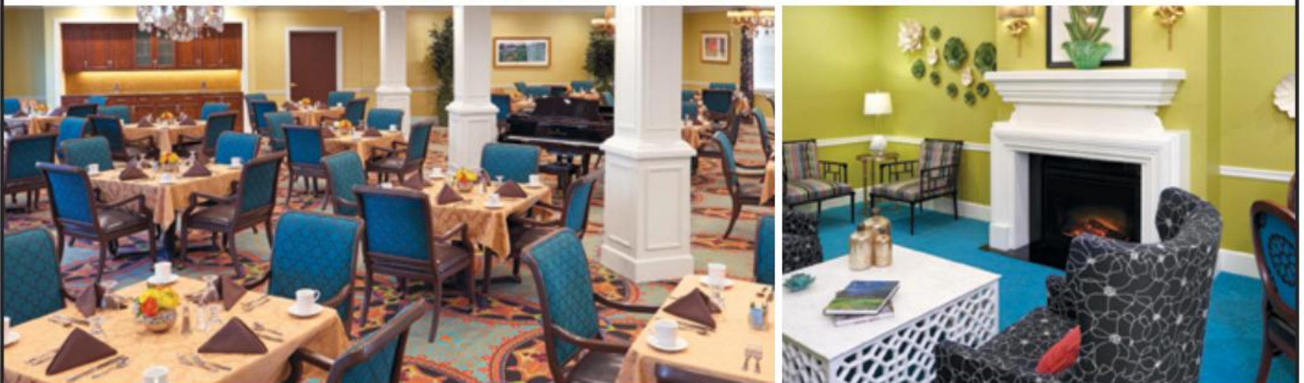
Photos: Dining Room, The Bristol at Lake Grove; Living Room, The Bristol at Holtsville

The Bristol ASSISTED LIVING thebristal.com